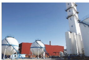
Electronic special gas