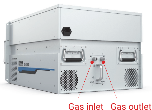
Gas inlet Gas outlet