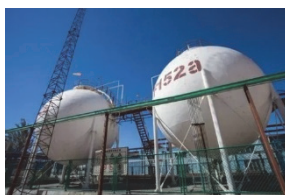
Fluorine chemical industry