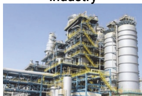
Coal chemical industry